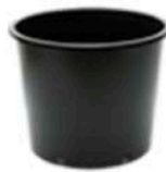
1 Gallon 6 - 7" dia

2 Gallon (2g) available in singles for $35