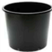
2 Gallon 8.5 - 9" dia

2 Gallon (2g) available in singles for $35