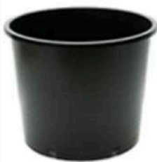
5 Gallon 10.5 - 12" dia

5 Gallon (5g) available in singles for $25 to $65